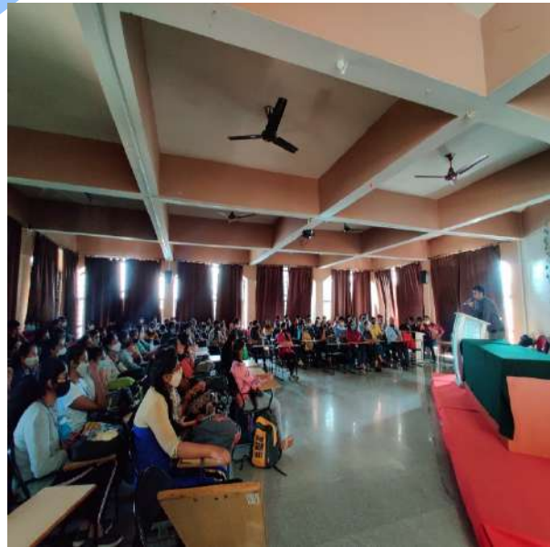
Active participation of students

A Get-together for batch 2020 was organized by Alumni association & Computer Science and Engineering on 25th Sep 2021, DBIT, Bengaluru.