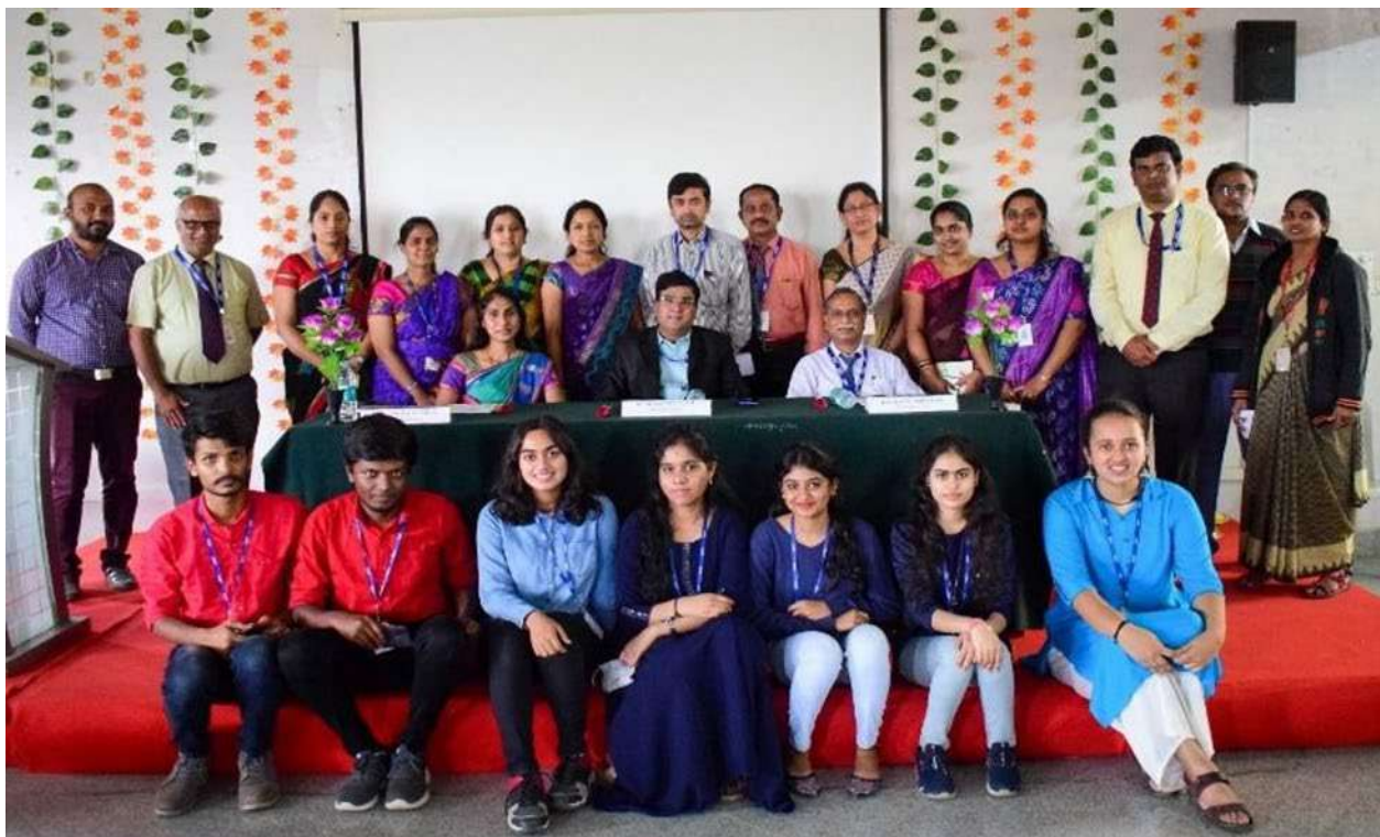
inauguration of forum " WILANIOS "

A Day of inauguration of forum " WILANIOS " and " Code-Storm " event was conducted by Department of CSE, DBIT on 23rd December 2020 -21 held at SH2, DBIT. The aim of the Event was for the participants to showcase their aptitude, reasoning and coding skills. Encouraging them to participate in these exciting events. Based on this event participant will get self-realization as well as countability on best practices in engineering intended to adapt quick and effective problem-solving methods.