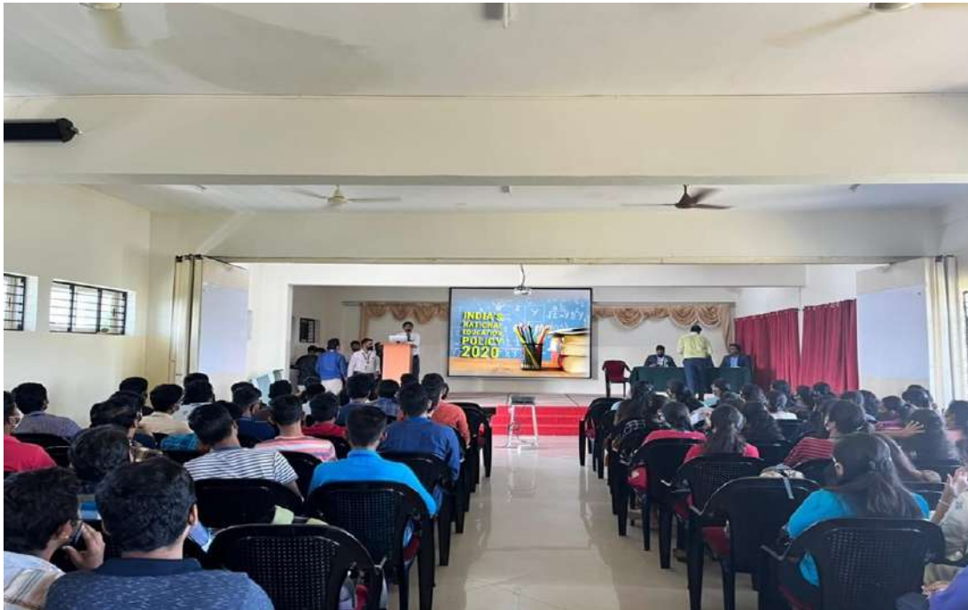
Students actively participated in Event

A Day of inauguration of forum " WILANIOS " and " Code-Storm " event was conducted by Department of CSE, DBIT on 23rd December 2020 -21 held at SH2, DBIT. The aim of the Event was for the participants to showcase their aptitude, reasoning and coding skills. Encouraging them to participate in these exciting events. Based on this event participant will get self-realization as well as countability on best practices in engineering intended to adapt quick and effective problem-solving methods.