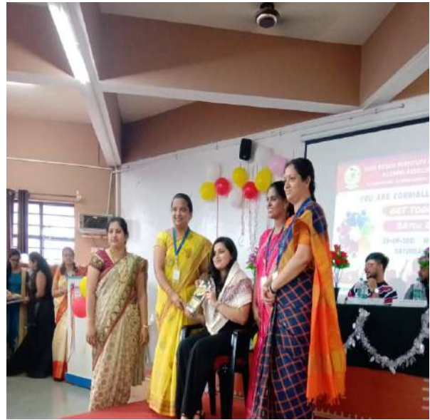
Token of gratitude given to 2020 batch students