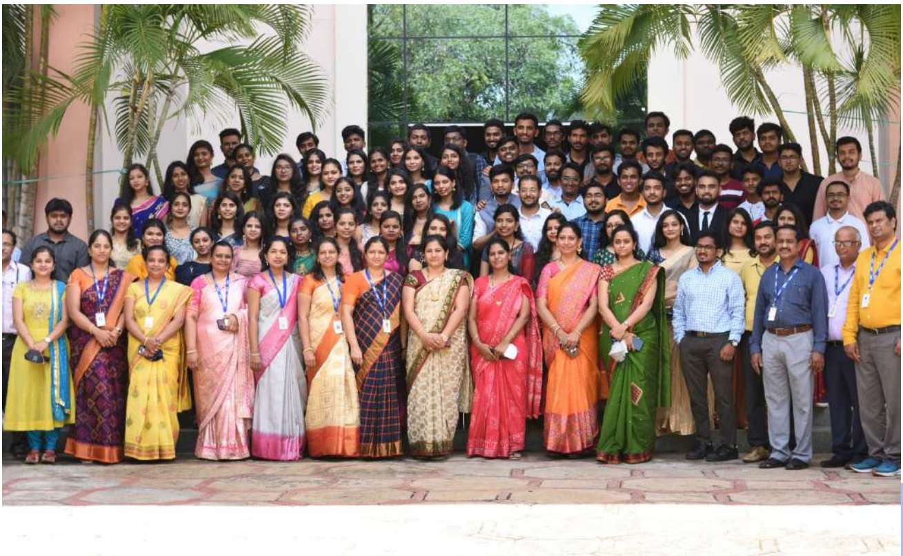
Group photo 2020 Batch students

A Get-together for batch 2020 was organized by Alumni association & Computer Science and Engineering on 25th Sep 2021, DBIT, Bengaluru.